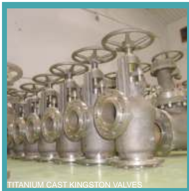
TITANIUM CAST KINGSTON VALVES