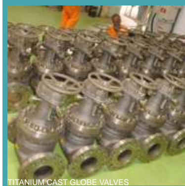
TITANIUM CAST GLOBE VALVES