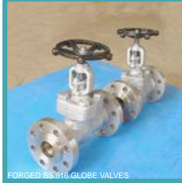
FORGED SS 916 GLOBE VALVES