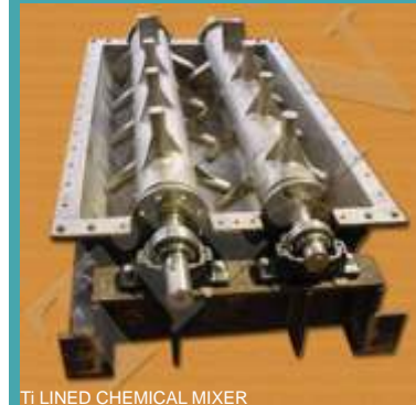
TI LINED CHEMICAL MIXER