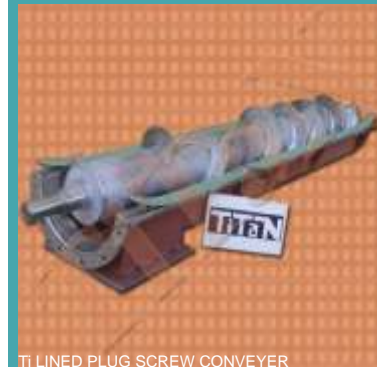
TI LINED PLUG SCREW CONVEYER